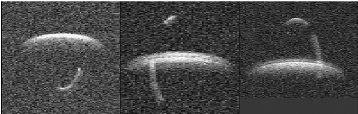
Fig. 2. Three radar delay-Doppler “images”, taken over several hours, of the binary asteroid 1999 KW4. The motion of the satellite is evident. Such radar presentations should not be interpreted literally as an image. Nevertheless, it is evident that a smaller object is orbiting the main body.

Tidal break-up is facilitated by another geophysical attribute of NEAs. Long ago, it was proposed [43] that larger main-belt asteroids might be “rubble piles” because inter-asteroidal collisions sufficiently energetic to fragment them would be insufficient to launch the fragments onto separate heliocentric orbits; instead, the pieces would reaccumulate into a rubble pile. It is now clear, from advanced modelling, that